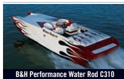
B&H Performance Water Rod C310

But a V-bottom, Howard's 28 Bullet, stole the show. For this test, Howard went with a custom 1,110-hp engine under the hatch. At 110-plus-mph, the ride was steady, reassuring and comfortable. Do I have a soft spot for the 28 Bullet? Yes. Does it deserve to be there? Absolutely.—MT