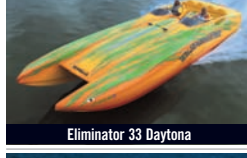
Eliminator 33 Daytona