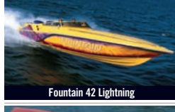
Fountain 42 Lightning