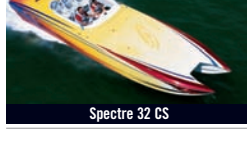
Spectre 32 CS