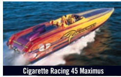
Cigarette Racing 45 Maximus