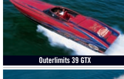
Outerlimits 39 GTX