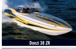
Donzi 38 ZR