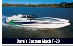
Dave's Custom Mach F-29