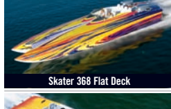
Skater 368 Flat Deck