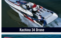
Kachina 34 Drone